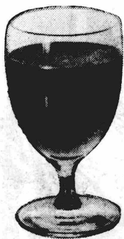
Seager Evans & Co Ltd, Wine Importers, London SE8